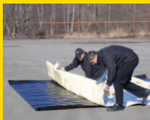
L-Rod Setup Stage 1