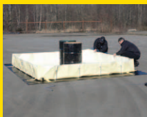
L-Rod Setup Stage 3

Guard against toxic spillage with the Insta-Berm™ : a fully collapsible, rapidly deployable fabric berm made from custom chemical-resistant materials. Use the Insta-Berm™ virtually anywhere for secondary containment that's durable and reliable. Comply with today's strict environmental rules – let an Insta-Berm™ be the impenetrable barrier between dangerous liquids and the environment.