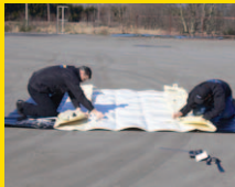
L-Rod Setup Stage 2