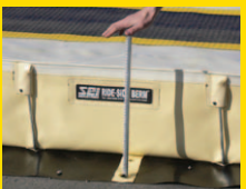
Eyelet patches for staking down berm